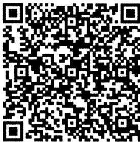
Evangelism / Outreach