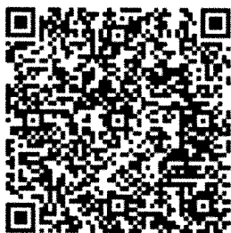
Truth, Trunk or Treat